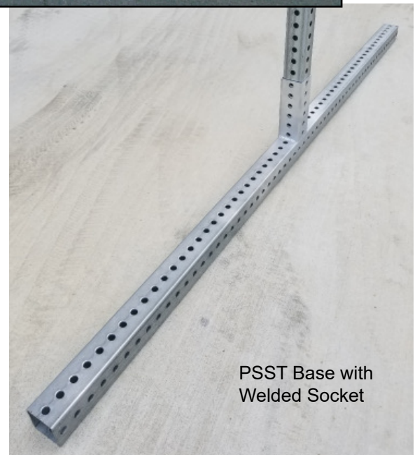
PSST Base with Welded Socket