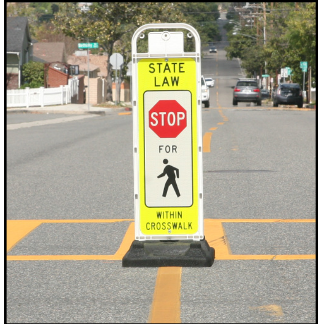
MASH Compliant Category 1 Device