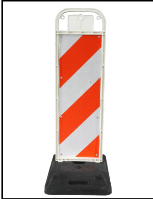
NCHRP350 Compliant: WZ-271