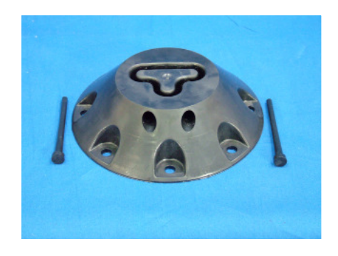
Repo Post 3" Base & Pins ( 2 incl.).