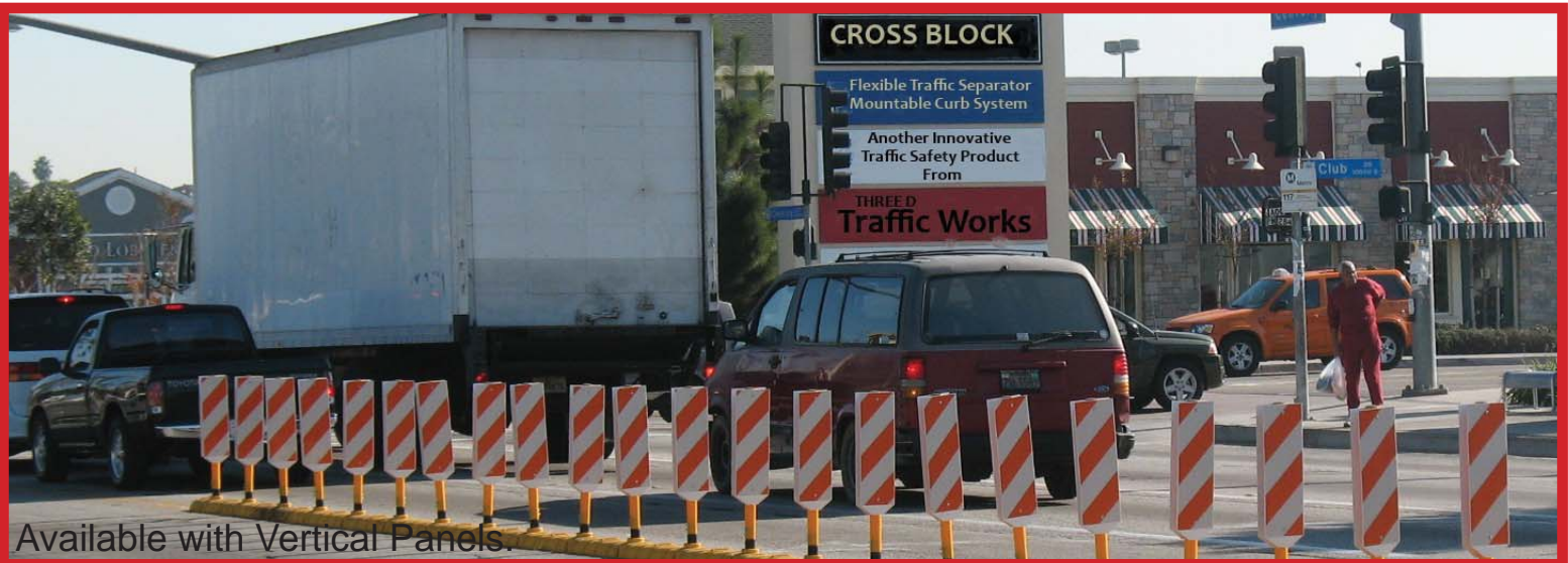
Available with Vertical Panels.

Lightweight, easy and economical to install using 2 anchor bolts for each 36" curb section to permanently install CROSS BLOCK on a variety of substrates. The modular, interconnecting curb sections allow the CROSS BLOCK to be easily shaped to fit the requirements of any job site and conform to the contours and variations common on roadways.