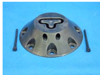
Repo Post 3" Base & Pins ( 2 incl.).