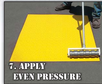
7. APPLY EVEN PRESSURE