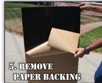
5. REMOVE PAPER BACKING