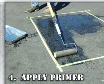
4. APPLY PRIMER