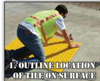
1. OUTLINE LOCATION OF TILE ON SURFACE