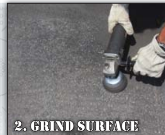
2. GRIND SURFACE