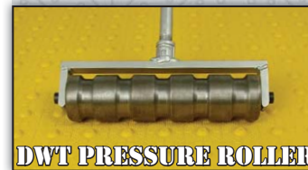
DWT PRESSURE ROLLER

Do not apply primer OR cut tile (Saw, grind, sand) without the use of a NIOSH approved cartridge respirator suitable to keep airborne mists and vapor concentrations below the time weighted threshold limit values. When using in poorly ventilated and confined spaces, use fresh-air supplying respirator or a self contained breathing apparatus.