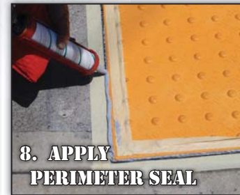
8. APPLY PERIMETER SEAL

Do not apply primer OR cut tile (Saw, grind, sand) without the use of a NIOSH approved cartridge respirator suitable to keep airborne mists and vapor concentrations below the time weighted threshold limit values. When using in poorly ventilated and confined spaces, use fresh-air supplying respirator or a self contained breathing apparatus.