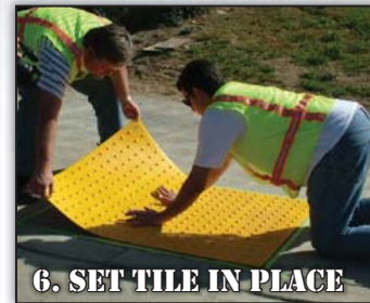
6. SET TILE IN PLACE