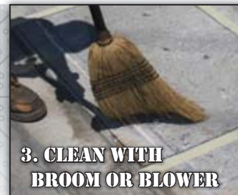
3. CLEAN WITH BROOM OR BLOWER